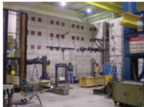
Structural Engineering Laboratory