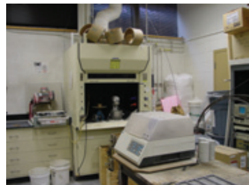
William S. Housel Concrete Pavement Laboratory