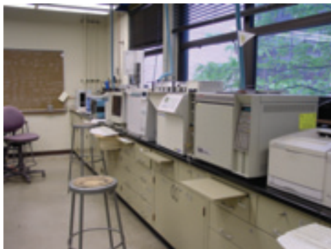
Environmental and Water Resources Analytical Laboratory